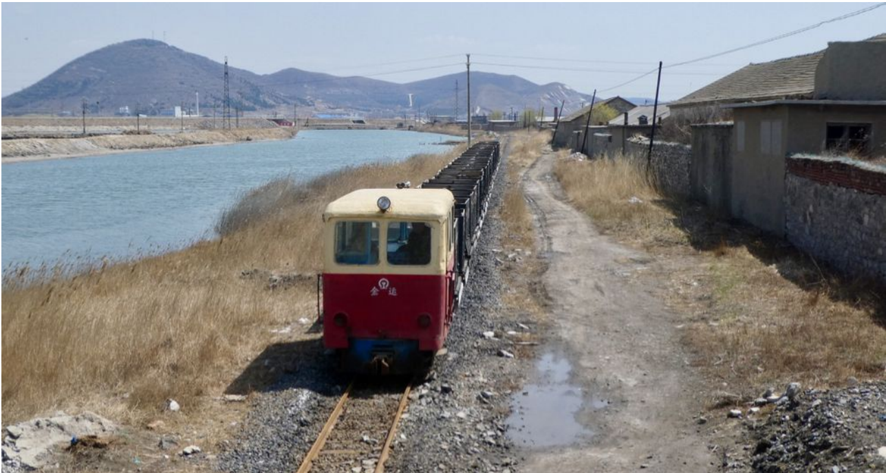
Jincheng Salt Railway 2018 - heading out with empty wooden salt wagons.