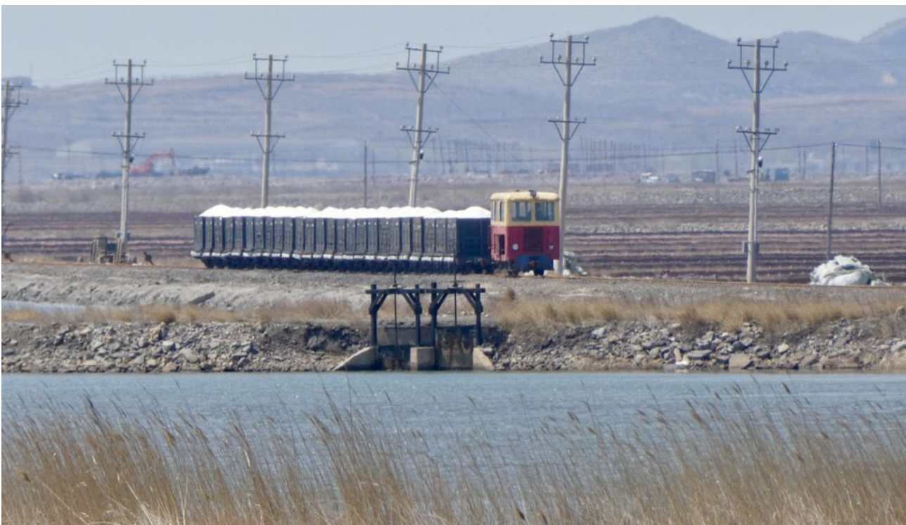
Jincheng Salt Railway 2018 - loco coupling up prior to heading back to the