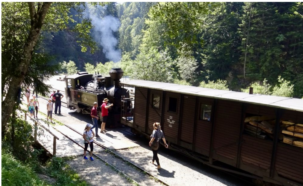
Viseu de Sus, Romania 2019 - the second of four steam-hauled tourist trains waiting to return after lunch at Paltin

Let me know if you are interested. Price not yet know but last year we paid £1400 each for an escorted 12 day tour with a minibus and a driver/guide. The self-drive option should be cheaper for 2020.